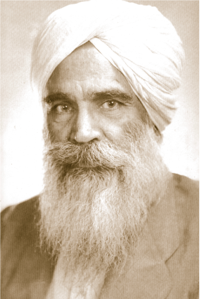
Sant Kirpal Singh Ji (1894-1974)