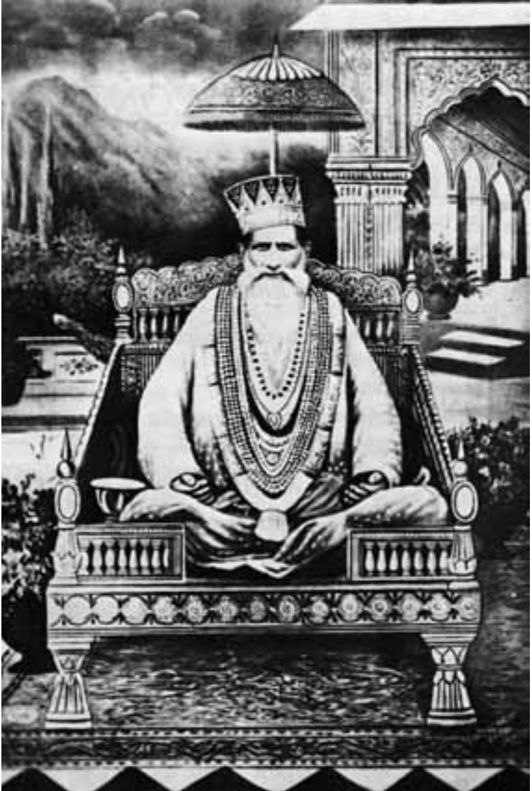
Swami Ji Maharaj Shiv Dayal Singh (1818-1878)